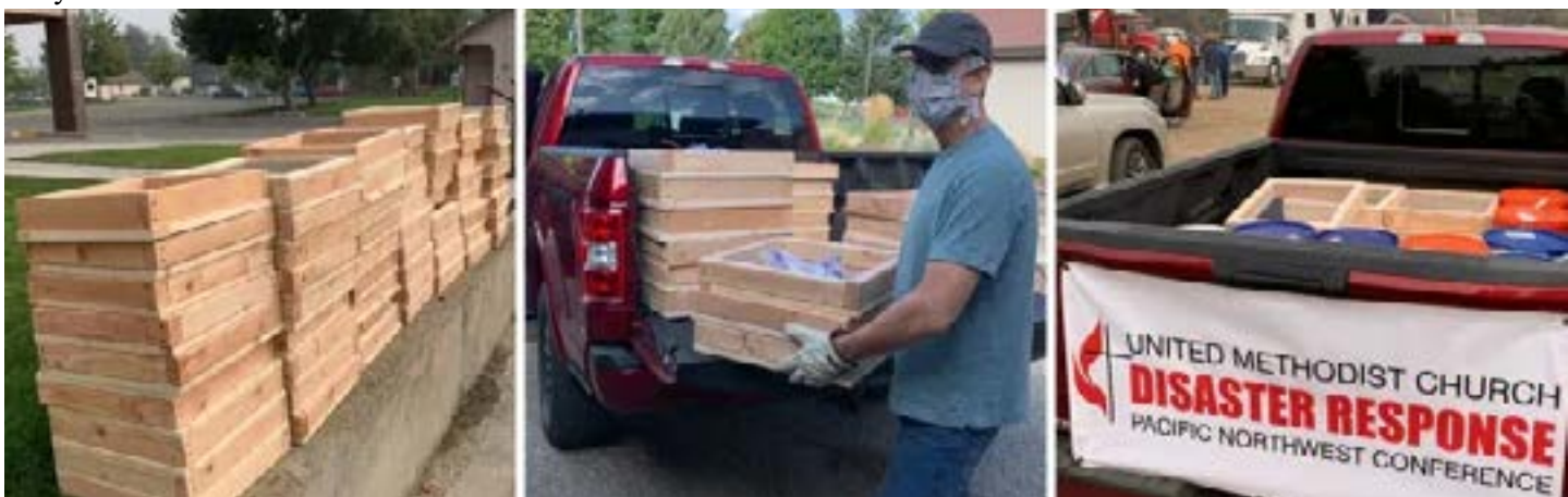
Ash shifiting kits assembled for wildfire survivors.