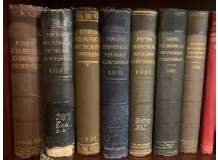
Older editions of Conference books

Please contact the World Methodist Council Headquarters to buy a copy. The books are first come first serve. Please email us at communications@worldmethodistcouncil.org .